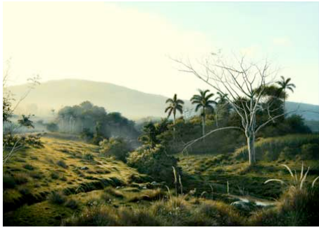
Giosvany Echevarria (1971), Daybreak at the Hills , 2007, 47 1/2 x 67 1/4 inches Oil on canvas Courtesy: Cernuda Arte, Florida

New York, NY, October 4, 2007 -- On November 1-4, 2007, the First Annual International Caribbean Art Fair (ICAFair), will be held at The Puck Building, 295 Lafayette St., in New York City, exclusively featuring artworks created by artists of Caribbean heritage. Thirty-two exhibitors from several Caribbean islands, Canada, France and the United States will showcase more than 100 artists.