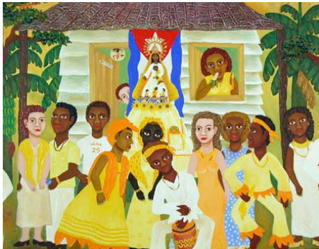
Javier Gonzalez Gallosa (1975) Oni pa Ochún , 2005 28 x 36 inches Acrylic on canvas

Contact: Marcel Wah, 301-651-6919; email: marcel.wah@icafair.com For Images: please send an email to press@icafair.com ; or call 301-651-6919.