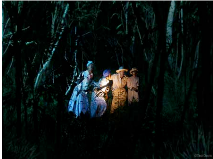
Ted Davis (1962) Night Flight to Maroon Ridge , 2006 11 x 16 inches Photograph, Digital inkjet print